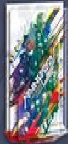
3-D Acrylic Diorama