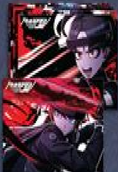
15 Character Art Cards