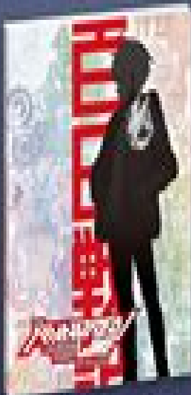
Full-Color Art Book