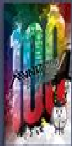
Lenticular Art Card