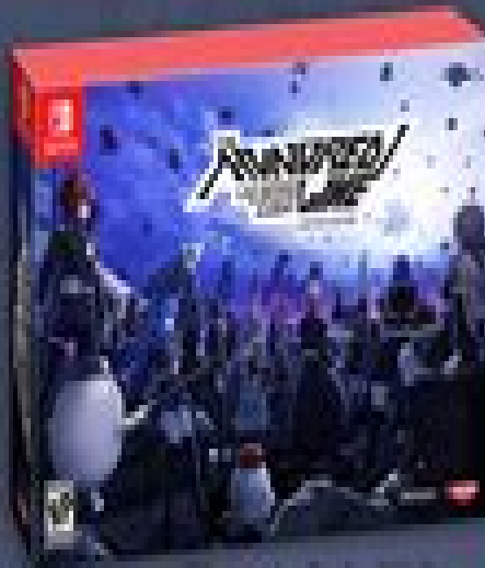
Nintendo Switch™ Game