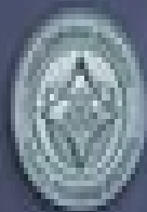
Metal Collector's Pin