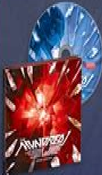
Original Soundtrack CD

Images, Titles, Games. Licensed to and published by XSEED Games. Nintendo Switch is a trademark of Nintendo. The ESRB rating score are registered trademarks of the Entertainment Software Association. Art not final. Items not shown to scale.