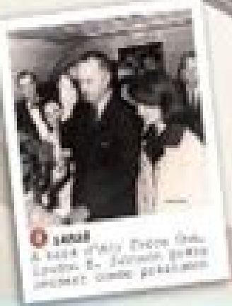
1888 A bord d'un avion privé le 21 novembre, Kennedy est élu président.

28 novembre 1963 Kennedy est officiellement élu à 49 ans le 21 novembre par deux tours. Il est élu président de la nation de 1963