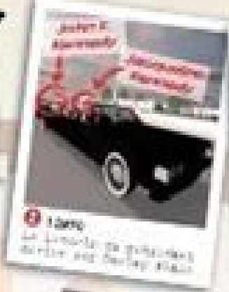
1880 Le limousine de président arrive au Dealey Plaza.