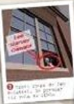
1885 Après avoir été assassiné, le président est porté au 250m.