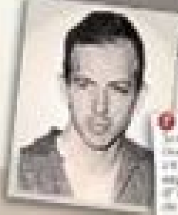
1889 Lee Harvey Oswald, 27 ans, employé d'un magasin de livres au 1000 DCE, assassiné