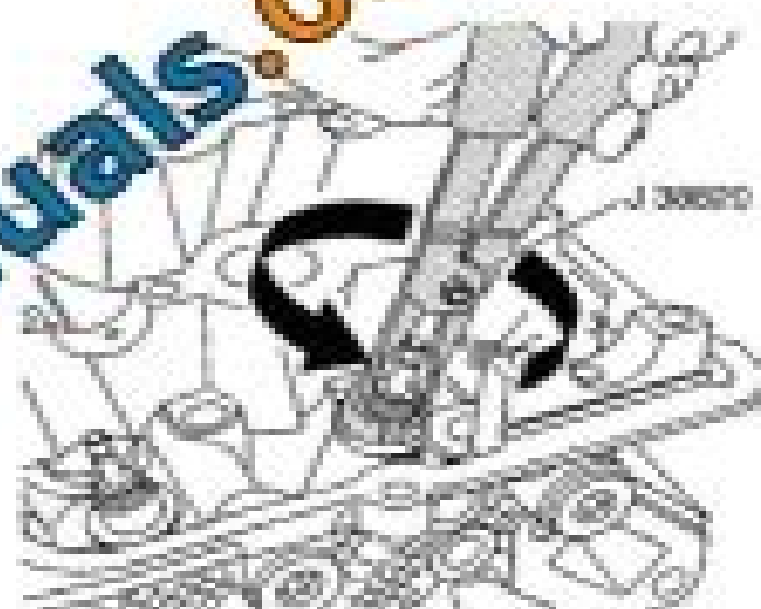
Fig. 100: Using J 38000 To Replace Valve Seal Cover of GENERAL MOTORS CORP.

Remove the valve locks. It is important to use the lock-washer tool. PDF Download Lower the arm and end of the J 44200 (2) and using the arm, push the right spring retainer. See Special Tools. Remove the valve spring retainer.