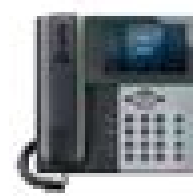
POLY EDGE E500/E550