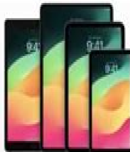
Table of Contents ⓘ