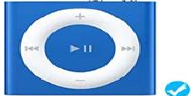
iPod shuffle 4/5/6/7