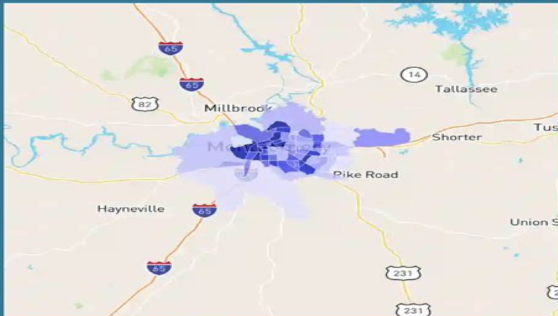
Montgomery, AL Crime Map By Neighborhood