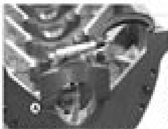
Received 10 May 2006; accepted 10 May 2006