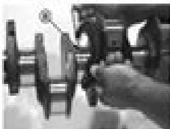
Keywords: adolescents; delinquency; family; intervention; parents

Reprints or permission to reprint: If you need to reprint, please contact the publisher.