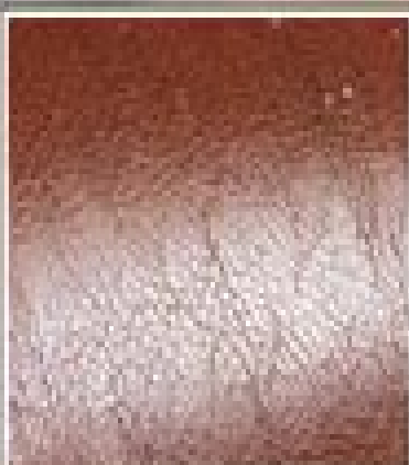
Cracked Leather Chairs