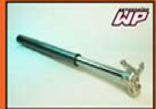
Shock Service Manual