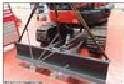
(1) Blade (2) Nylon sling