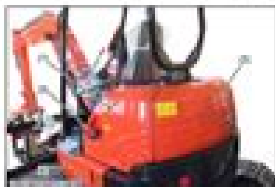
(1) Boom LH (2) Rear boom (3) Front boom