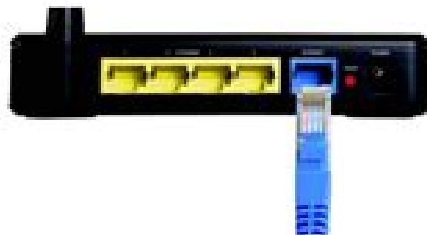
Figure 4-5: Connecting Another Router