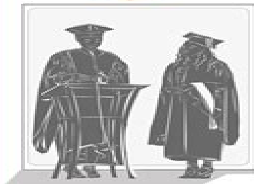
PHOTO 3 | SINGLE PORTRAIT