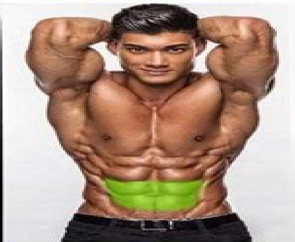
Hanging Leg Raises