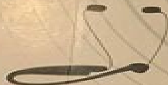
BLUETOOTH WIRELESS STEREO HEADSET