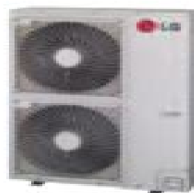
LV420HV (42,000 Btu/h) LV480HV (48,000 Btu/h)