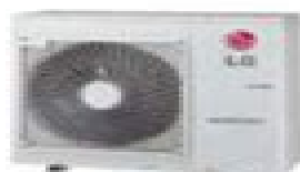
LV181HV4 (18,000 Btu/h) LV241HV4 (24,000 Btu/h)