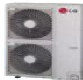
LV361HV4 (36,000 Btu/h)