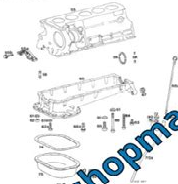
Copyright © 2000 by John Wiley & Sons, Inc.