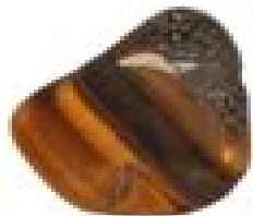
Oeil de tigre