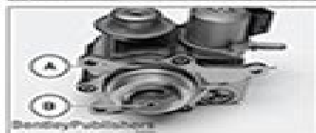
High pressure fuel system service on turbo engine, including replacing HP-Fuel pump, 55G Fuel Tank and Fuel Pump