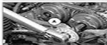
Detailed engine service, including VANOS camshaft timing adjustment N12 Camshaft Timing Chain