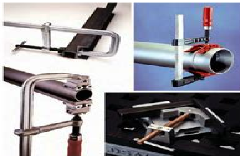
Figure 3-14. These various clamps are used to position and hold parts to be welded. (Bessey Tools North America)