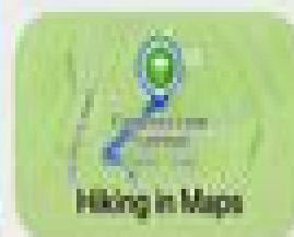
Hiking in Maps