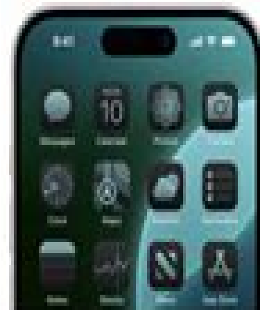
Home Screen customization