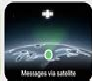
Messages via satellite