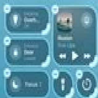
Control Center customization