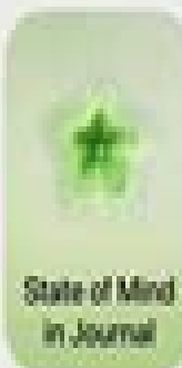
State of Mind in Journal