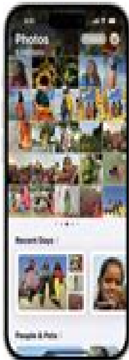
Biggest-ever Photos update