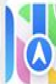
Larger icons on Home Screen