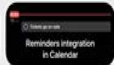
Reminders integration in Calendar