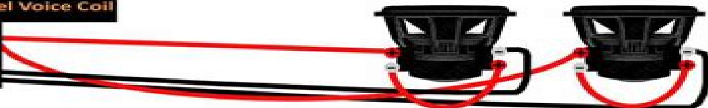
3 Sub, Single (Parallel) Voice Coil