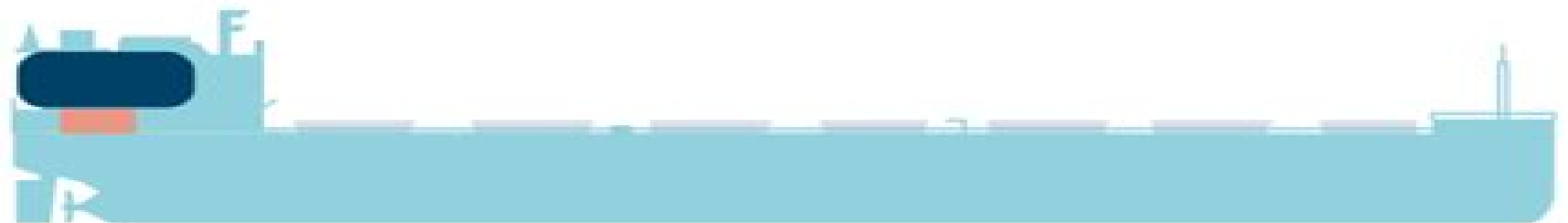
Figure 4: Simplified schematic of bulk carrier reference design (fully pressurized).

■ FPR (fuel preparation room) ■ Fuel storage tank