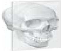
(a) Frontal (coronal)