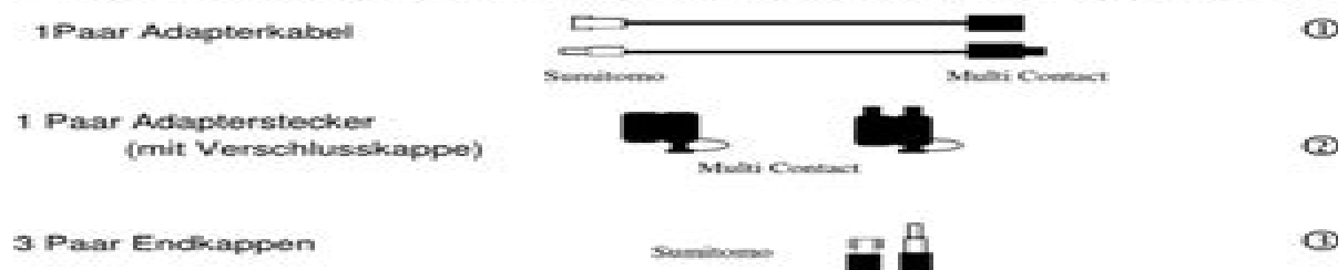
Abbildung 10: Inhalt PHÖNIX MHI Adapterset

Hinweis: Das Adapterset ist nicht im Lieferumfang enthalten und muß nach Bedarf bestellt werden.