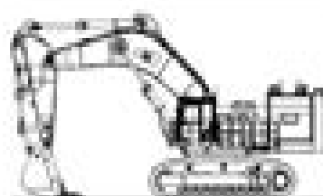
Figure 3 Hydraulic activation control lever - parallel position