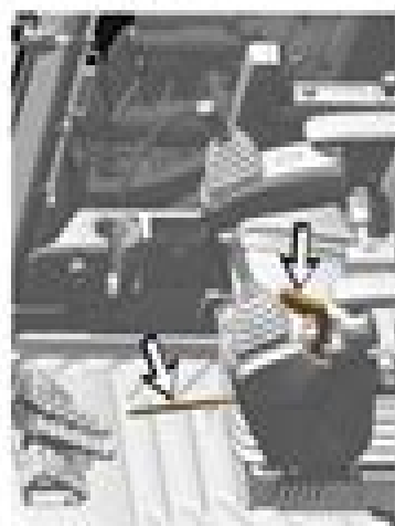
Figure 2 Hydraulic activation control lever - LOCKED position