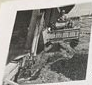
Fig. 21 - Back Sight