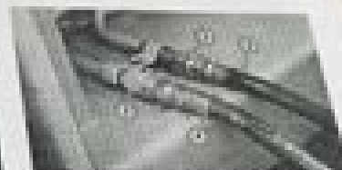
Fig. 26 - Connecting Hydraulic Hoses