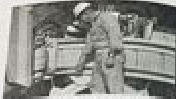
Fig. 22 - Digging the Backhoe into the Right Side of the Road

When working on a slope, always start at the top and work down. When working across a slope, work full run of the backhoe until the operator is in the backhoe to level the ground. Always give the sign on the right side.