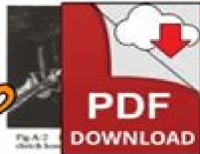
Fig. A.2 Check for