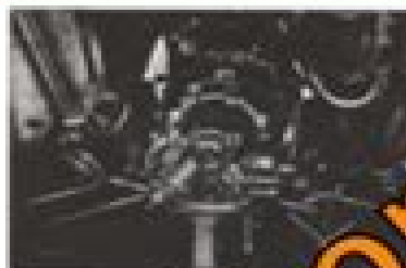
Fig. A.1 Removing the starting motor