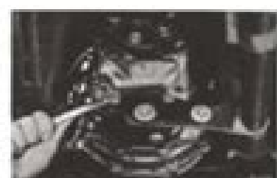
Fig. A.4 Removing the exhaust pipe support bracket on the exhaust pipe