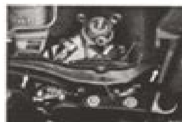
Fig. A.5 Removing the exhaust pipe support bracket - automatic transmission