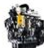
JCB 444 ENGINES