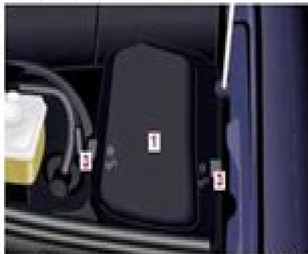
1 - Fuse box in engine compartment, left-hand side 3 - Tabs