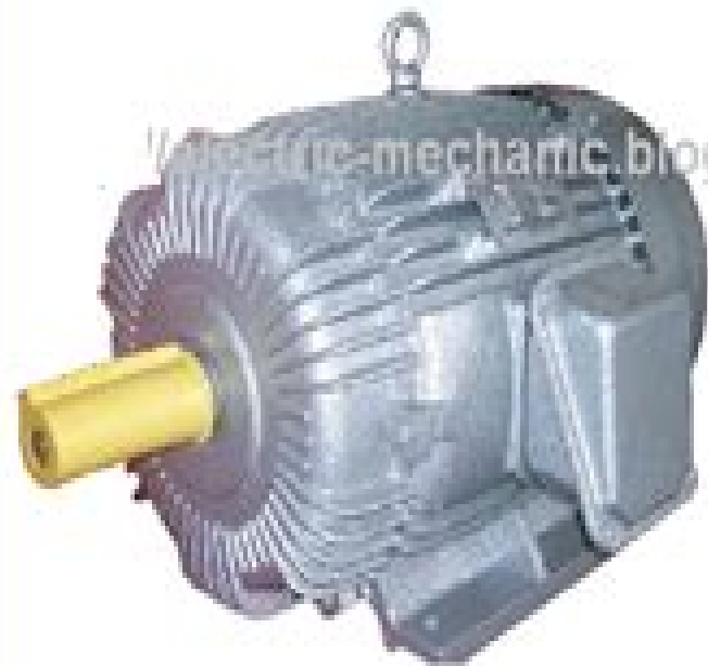
INDUCTION MOTOR 3 PHASE 380 V/15 KW