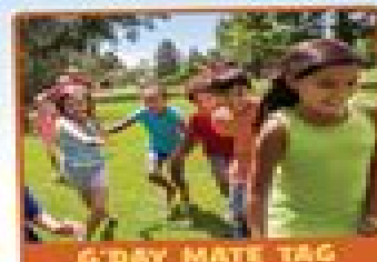
G'DAY MATE TAG