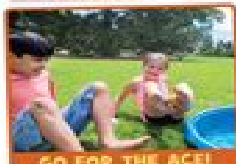
GO FOR THE ACE!