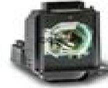
TV Lamp 915001011 with Mounting for Mitsubishi TV $25.75 - Philips / Mats. New Box ★★★★★ = 5