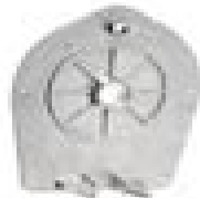
Wireguard WP-3023 Antenna Base Plate 10 $15.95 - 40% off Only 4 left in stock - order soon ★★★★★ = 3