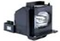
915040001 - Lamp With Mounting $25.00 - Philips / Mats. New Box ★★★★★ = 5