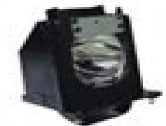
TV Lamp 915001011 for 917500000, 9175710, WD-67114, WD-67023, WD-65733, WD-65724, WD-65603, WD-73713