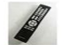
Whisper Remote Control Part Number 200700000 $24.95 Only 1 left in stock - order soon ★★★★★ = 3