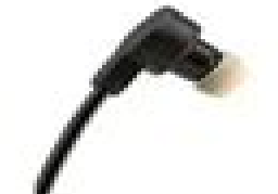
TV 5000 4000F Ear Taps for TV Earbuds - 8 per More Details: Item $2.00 ★★★★★ = 4