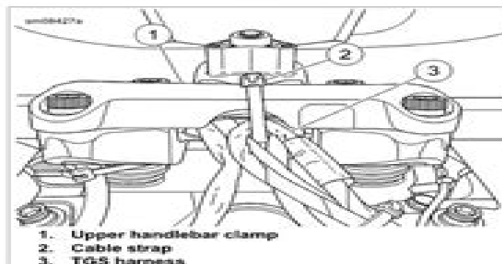
Figure 2-31. Secure TGS Harness