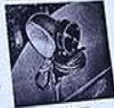
Fig. 12 - Exhaust Pipe Cap

A exhaust pipe cap is available for the engine. This cap is made of aluminum and is used to protect the exhaust pipe from dirt and debris. It is made of aluminum and is used to protect the exhaust pipe from dirt and debris.