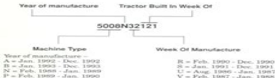
Fig. 3—The tractor serial number identifies machine type, year of manufacture, week of manufacture during specific year, and specific unit manufactured during that week. The example shown identifies a two-wheel-drive 390 tractor which was the 121st tractor manufactured during the 32nd week of 1988.

Machine type — 5006 M-F 375 2WD 5007 M-F 375 4WD 5008 M-F 390 2WD 5009 M-F 390 4WD 5010 M-F 398 2WD 5011 M-F 398 4WD 5206 M-F 383 2WD