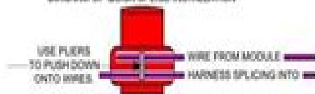
DIAGRAM OF QUICK SPICE INSTALLATION