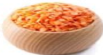
Red split lentils ( Lens culinaris )