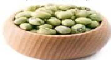
Yellow kidney beans ( Phaseolus vulgaris )