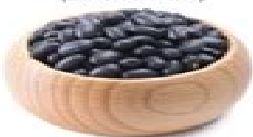
Black turtle beans ( Phaseolus vulgaris )