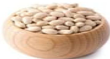
Navy beans ( Phaseolus vulgaris )