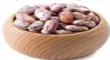
Cranberry beans ( Phaseolus vulgaris )