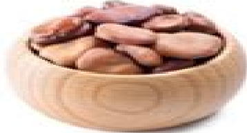
Fava bean ( Vicia faba )