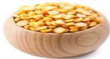
Yellow split peas ( Pisum sativum )