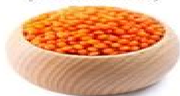
Whole red lentils ( Lens culinaris )