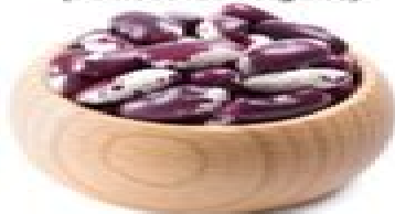
Heirloom Bean ( Phaseolus vulgaris )