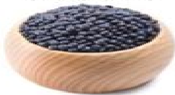
Beluga lentils ( Lens culinaris )