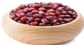
Adzuki beans ( Vigna angularis )