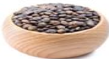
Puy lentils ( Lens esculenta puyensis )