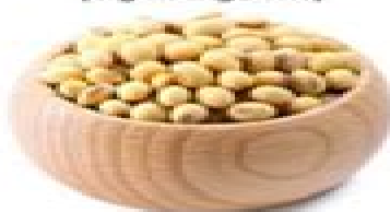
Soybean ( Glycine max )