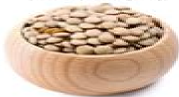
Laird green lentils ( Lens culinaris )