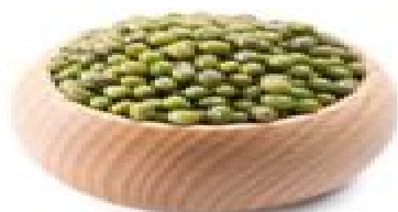
Green mung beans ( Vigna radiata )