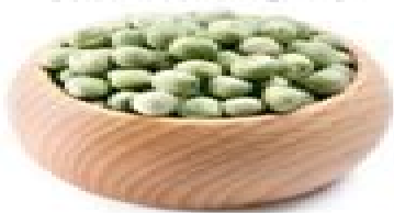
Green peas ( Pisum sativum )