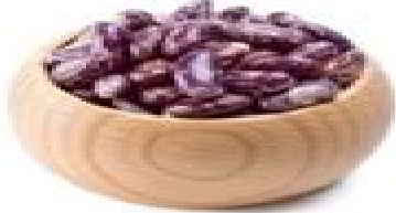
Speckled kidney beans ( Phaseolus vulgaris )