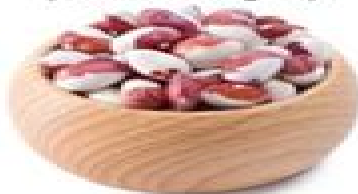
Painted Pony bean ( Phaseolus vulgaris )