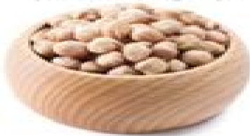
Chickpeas ( Cicer arietinum )