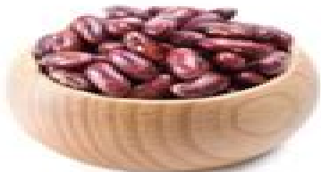
Alavese pinto bean ( Phaseolus vulgaris )