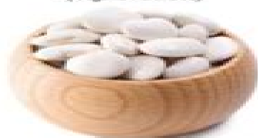
Lima bean ( Phaseolus lunatus )