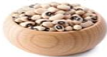
Black-eyed bean ( Vigna unguiculata )