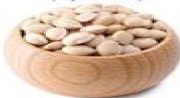
Hyacinth beans ( Lablab purpureus )