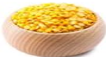
Yellow split lentils ( Lens culinaris )