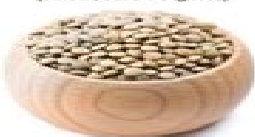
Green lentils ( Lens culinaris )