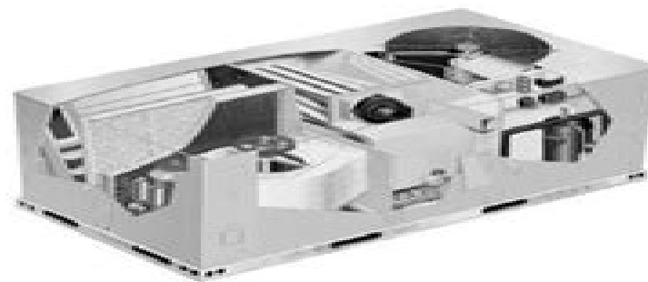
LGA060 (5 TON) SHOWN

If the unit must be lifted for service, rig unit by attaching four cables to the holes located in the unit base rail (two holes at each corner). Refer to the installation instructions for the proper rigging technique.