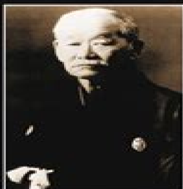
Jigorô Kanô JUDO

L'histoire des trois fondateurs des arts martiaux