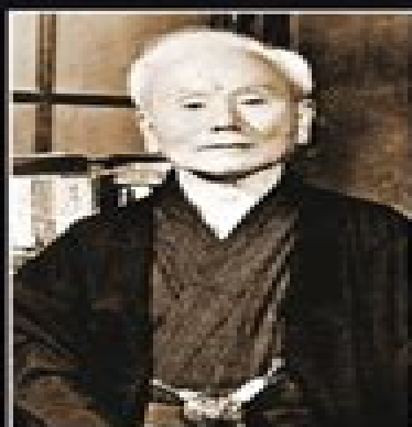
Gichin Funakoshi KARATEDO