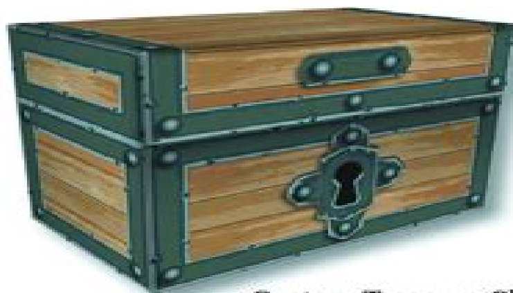
Custom Treasure Chest Book Holder