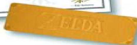
2.5x7.5 Gold 2-Sided Bookmark

BOX SET INCLUDES: • The Legend of Zelda: Phantom Hourglass • The Legend of Zelda: Twilight Princess • The Legend of Zelda: Spirit Tracks • The Legend of Zelda: The Wind Waker • The Legend of Zelda: Skyward Sword • The Legend of Zelda: Breath of the Wild