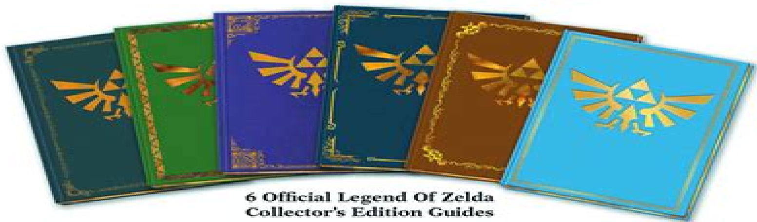
6 Official Legend Of Zelda Collector's Edition Guides