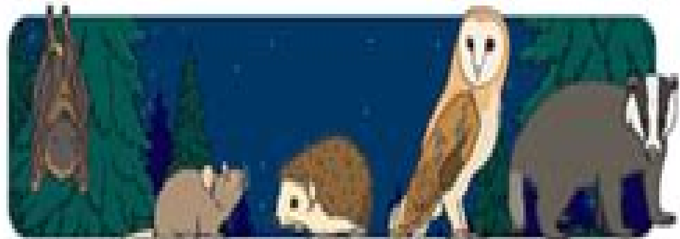
Bats mice hedgehogs owls badgers

Carry out your own research project into nocturnal animals and be ready to present your ideas to the class! You could find out about: