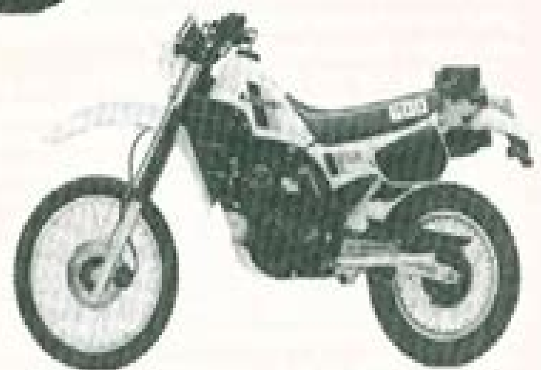
KL600-A1 European Model