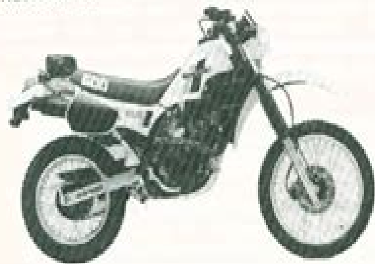
KL600-A1 US Model