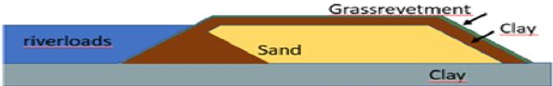
b) Delta dike