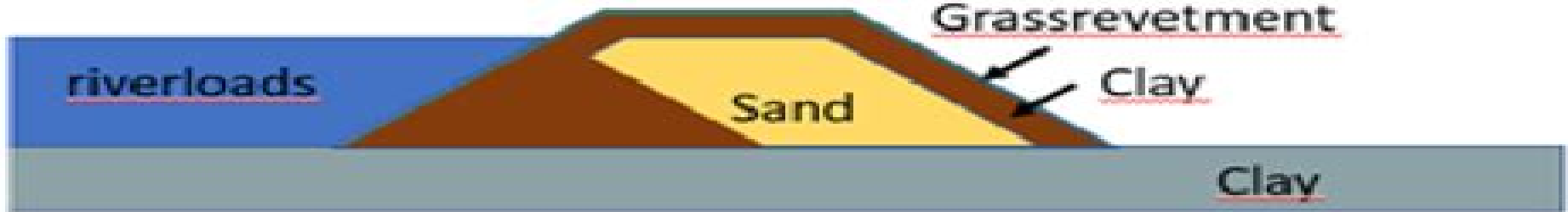
a) Present dutch dike