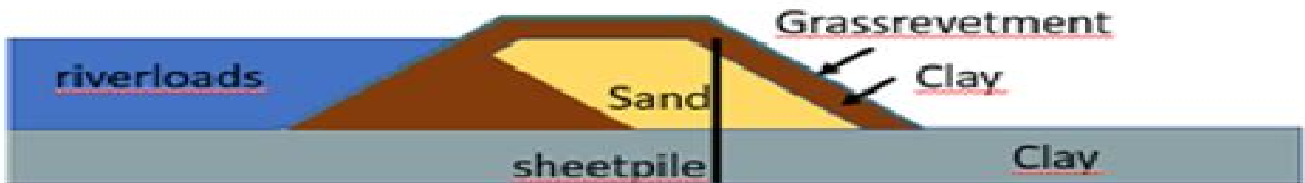
c) Ductile dike with sheetpile