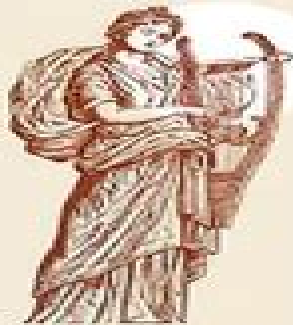
Erato Love Poetry