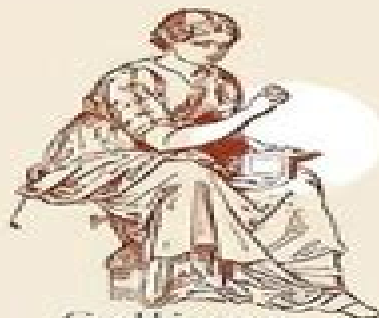
Calliope Epic Poetry