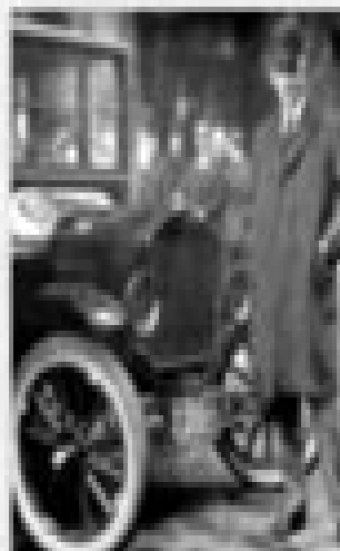
Henry Ford avec son modèle T en 1921