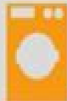
Machine à laver