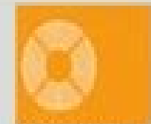
Pompe à chaleur