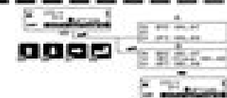
Fig. 3 Hydraulic system diagram showing the pump, valves, and hoses.