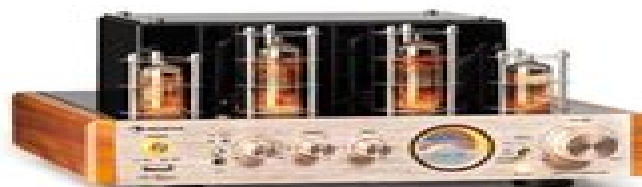
(b) Amplificateur audio à tubes.