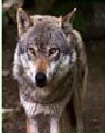
LOUP GRIS COMMUN (CANIS LUPUS LUPUS)