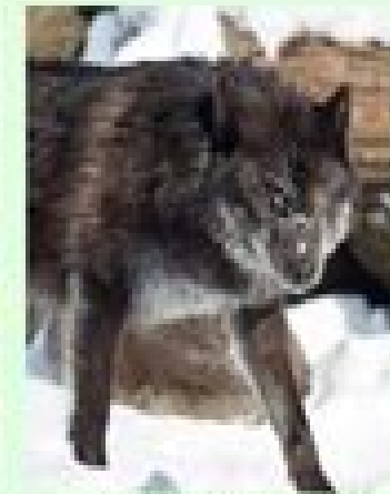
LOUP D'ALASKA (CANIS LUPUS PAMBASILEUS)