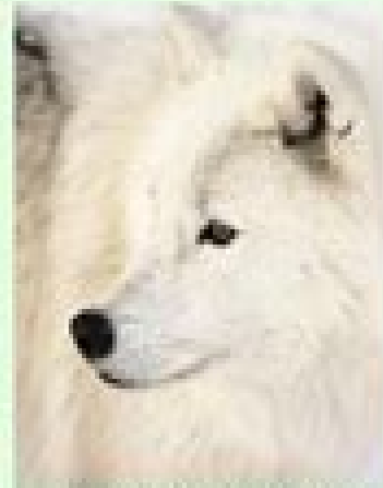
LOUP DE SIBÉRIE (CANIS LUPUS ALBUS)