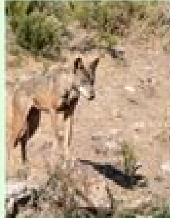
LOUP D'ARABIE (CANIS LUPUS ARABS)