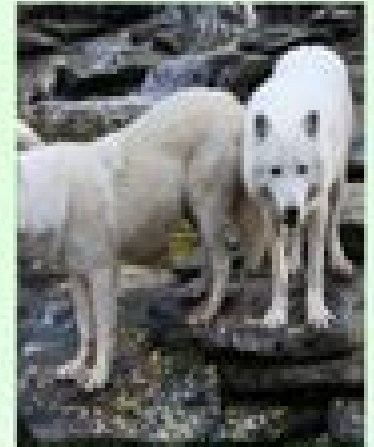
LOUP ARCTIQUE (CANIS LUPUS ARCTOS)