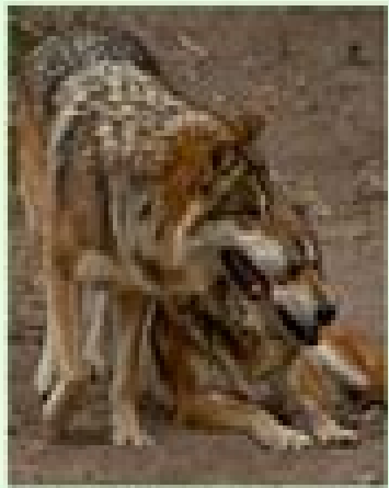
LOUP MEXICAIN (CANIS LUPUS BAILEYI)