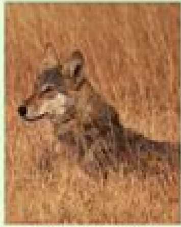
LOUP DES INDES (CANIS LUPUS PALLIPES)