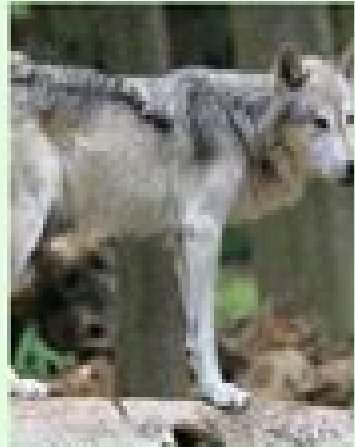
LOUP GRIS COMMUN (CANIS LUPUS LUPUS)